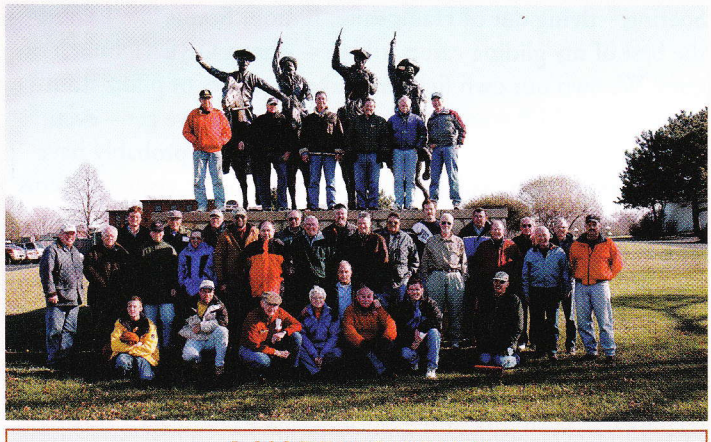
A HAPPY GROUP! The gang at Sky Soaring.

experience in a glider. Been doing it for a couple of years now and very much enjoy it.